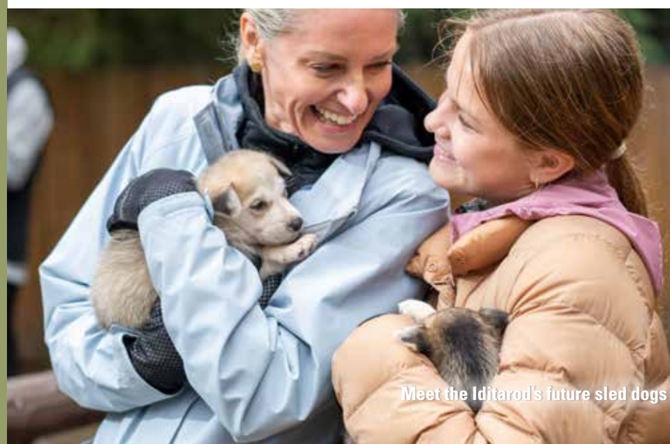
Meet the Iditarod's future sled dogs