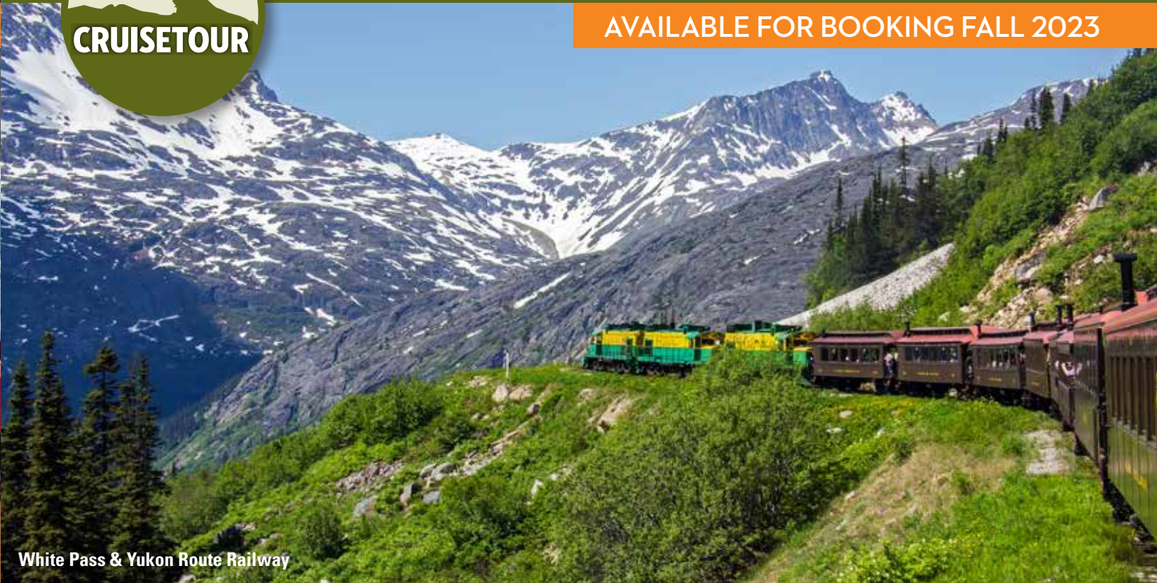
White Pass & Yukon Route Railway