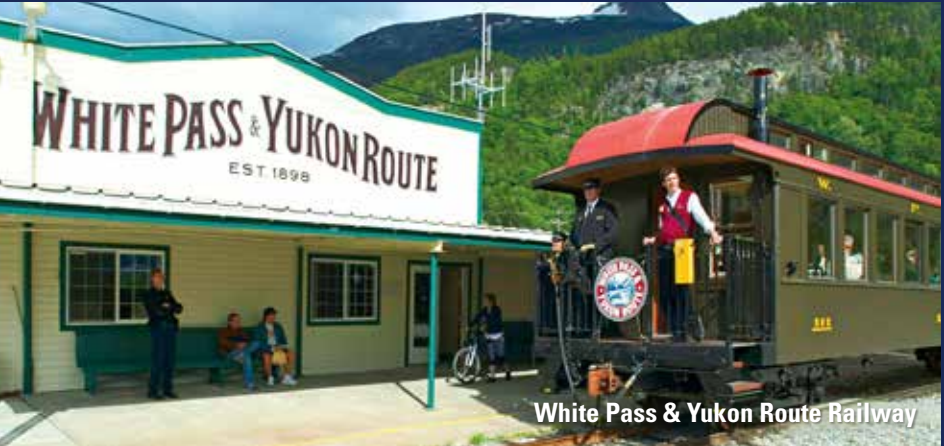
White Pass & Yukon Route Railway