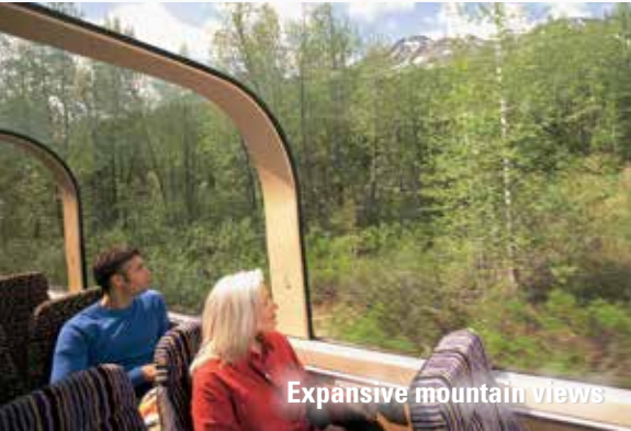
Expansive mountain views