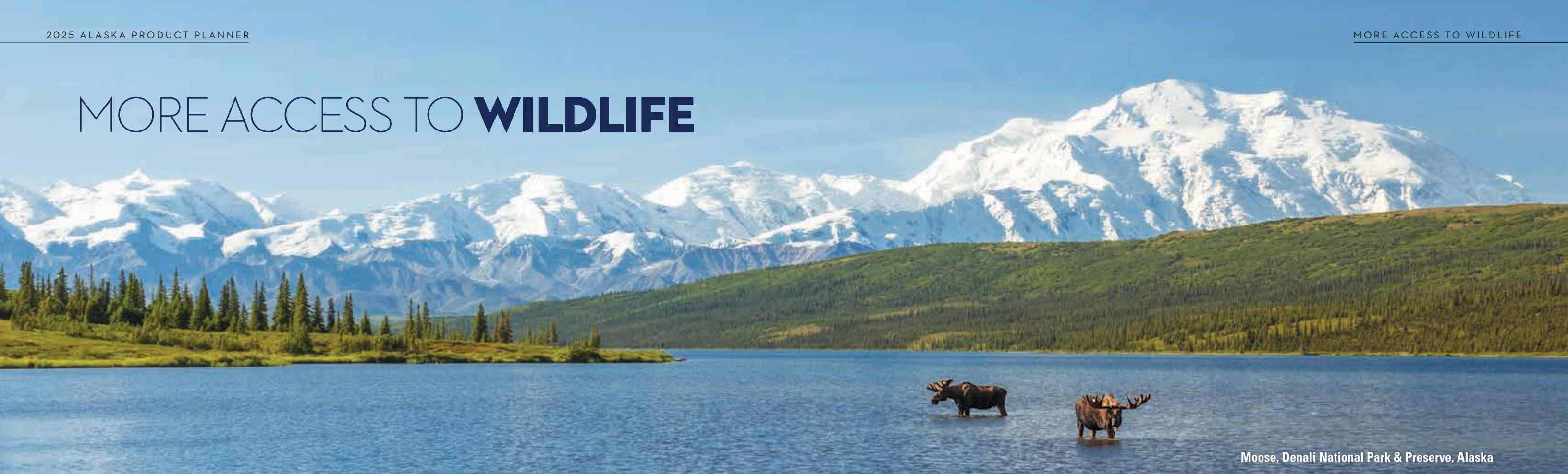
Moose, Denali National Park & Preserve, Alaska