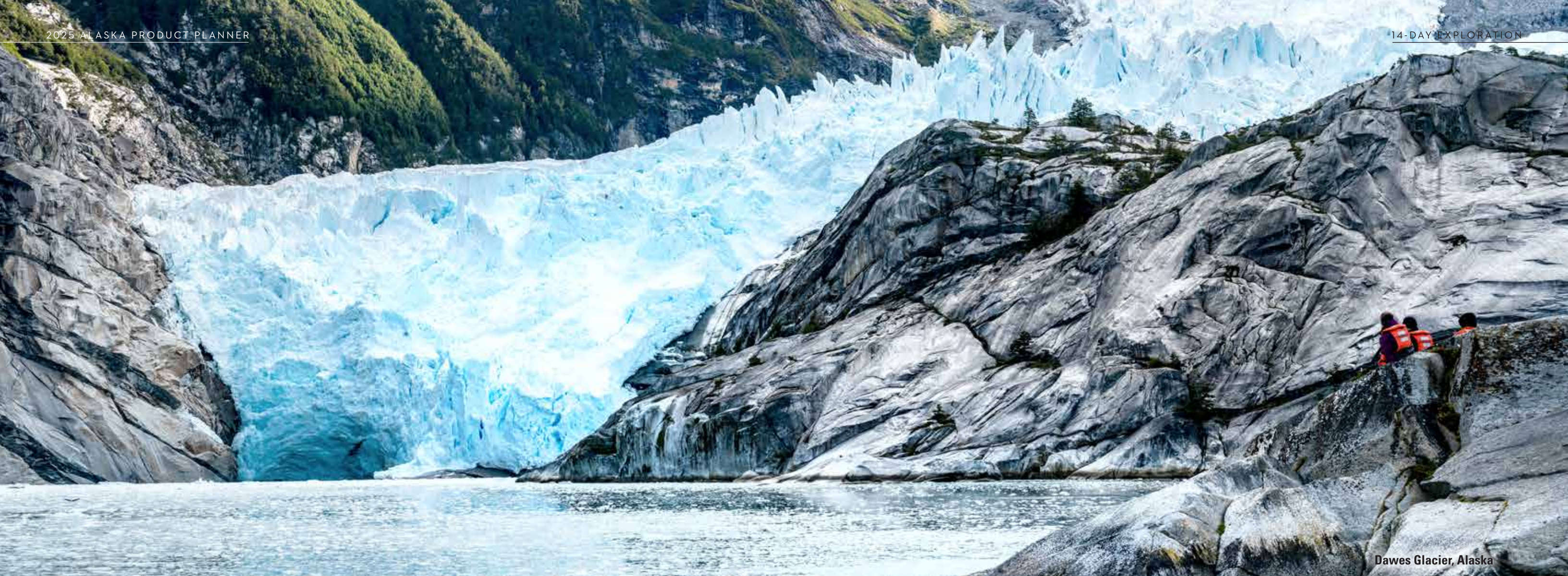
Dawes Glacier, Alaska