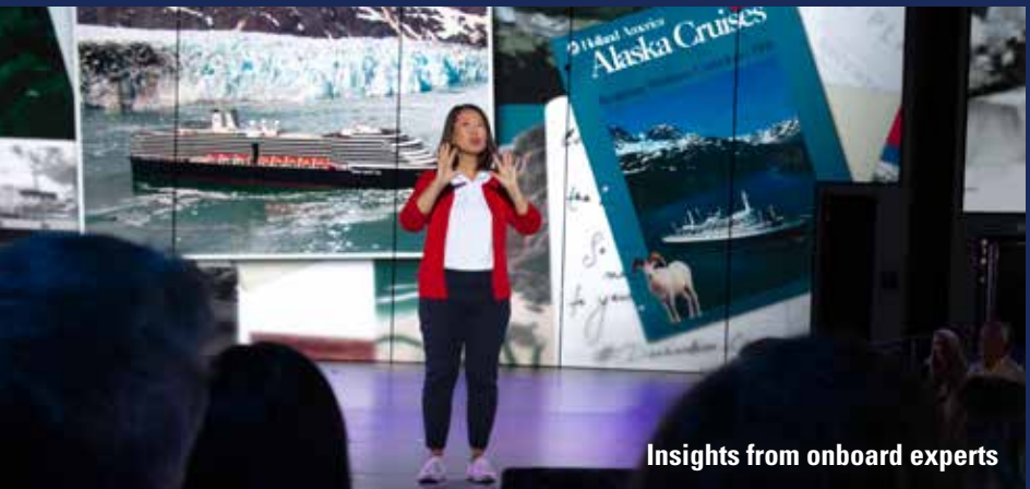
Insights from onboard experts