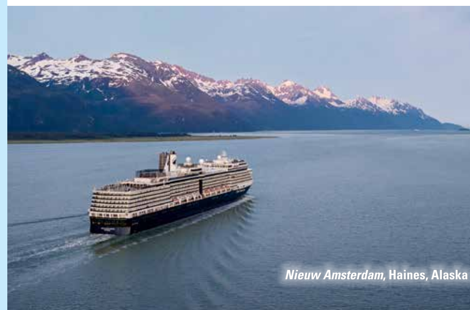
Nieuw Amsterdam, Haines, Alaska