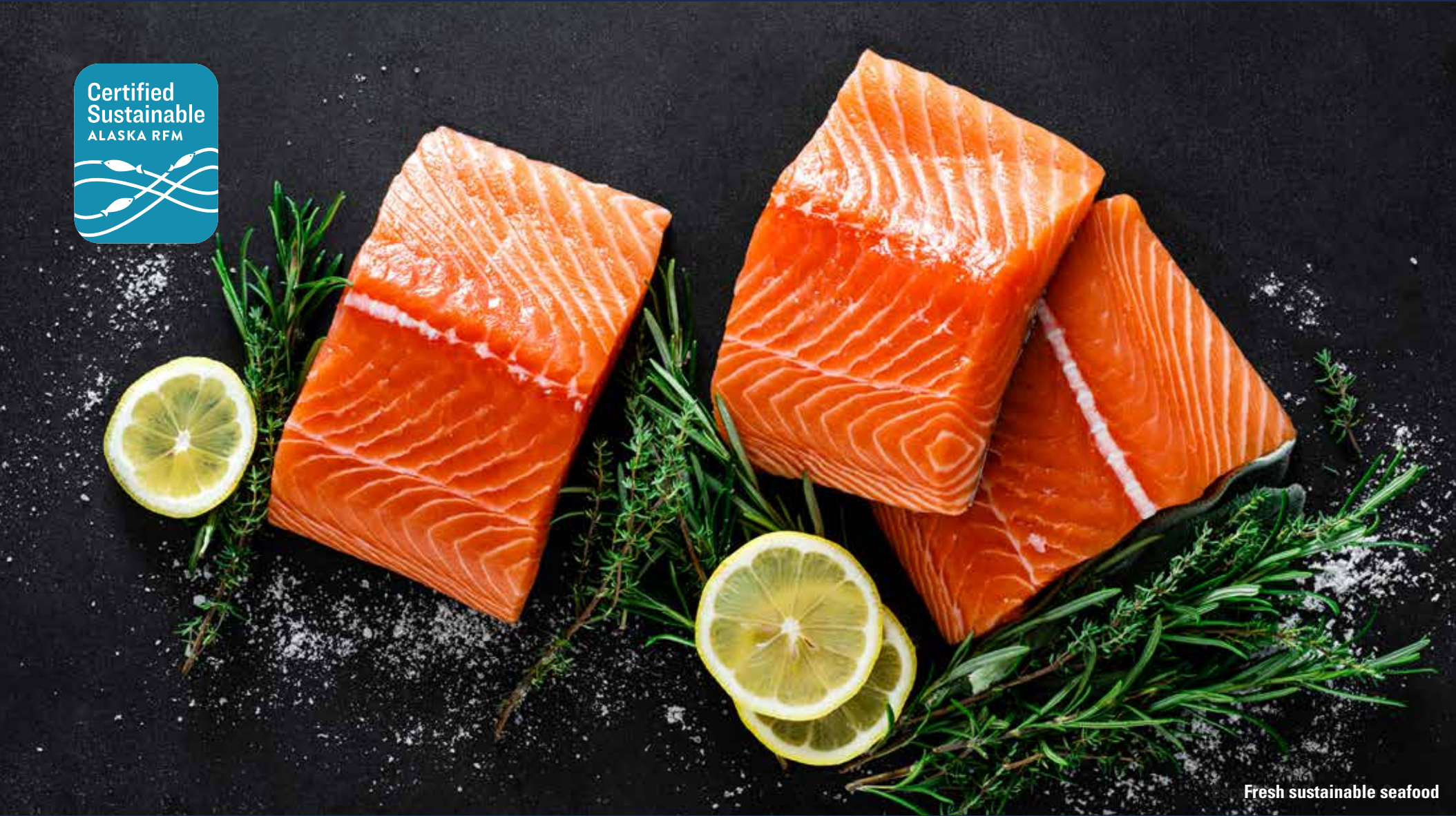
Fresh sustainable seafood