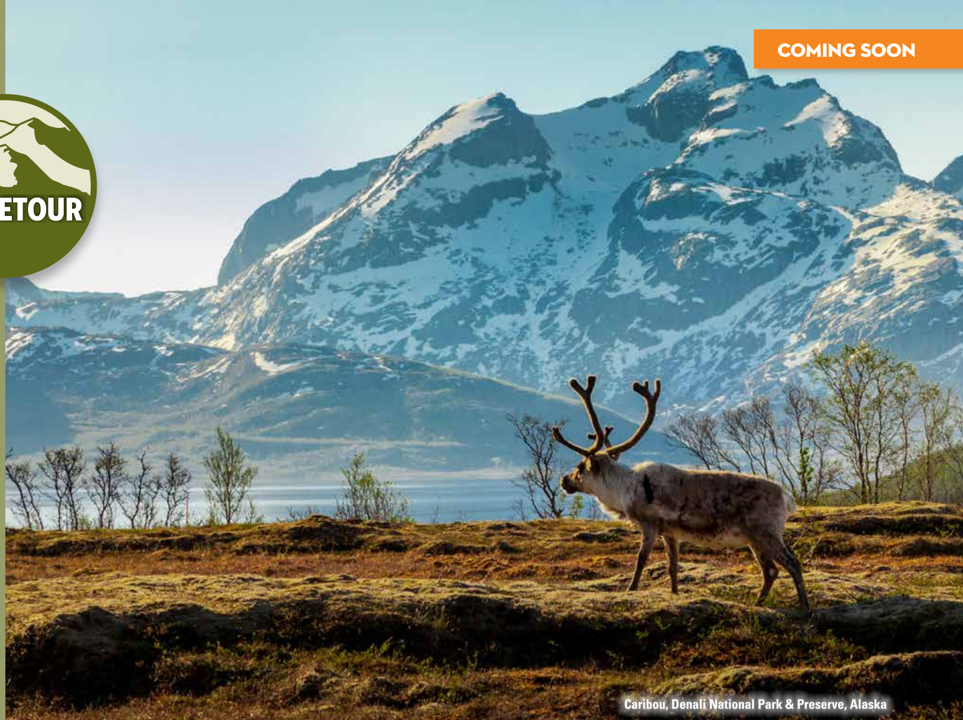
Caribou, Denali National Park & Preserve, Alaska