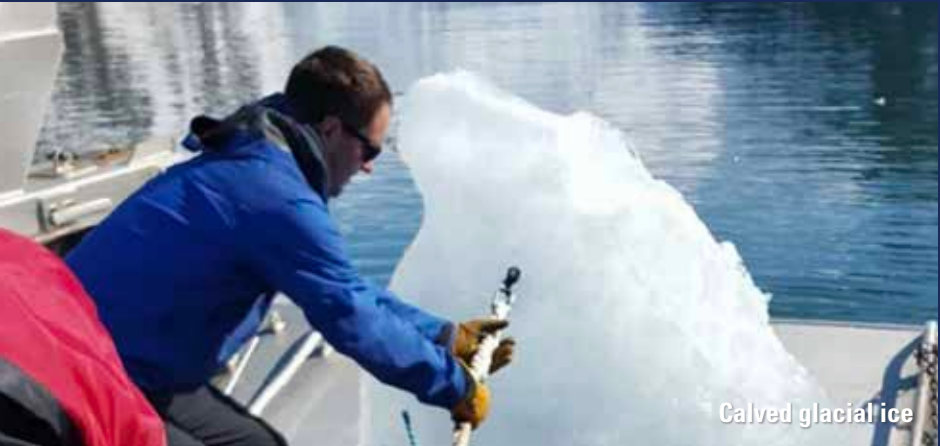
Calved glacial ice