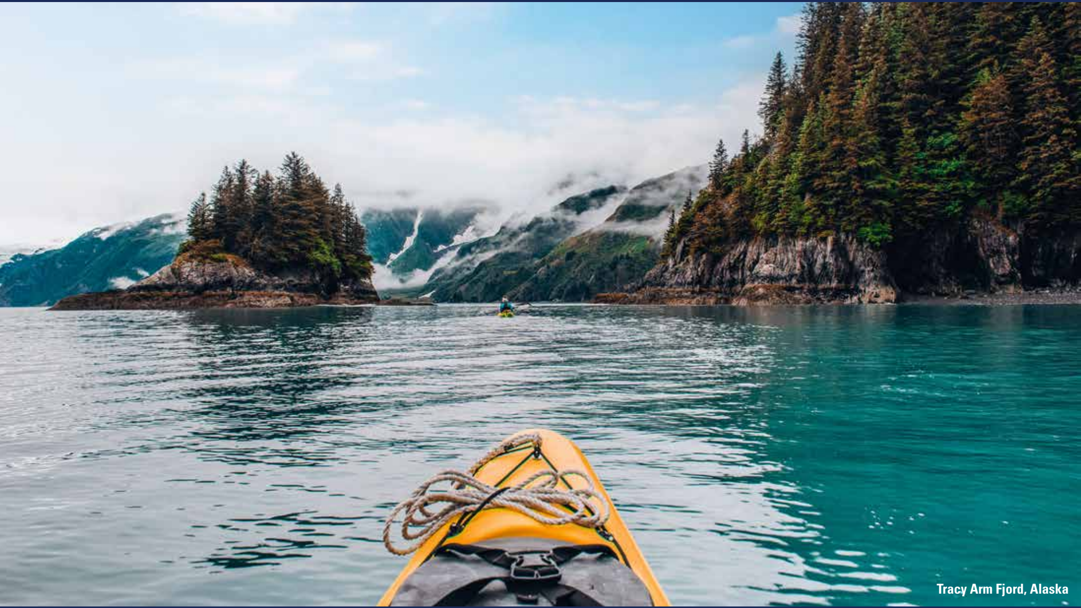
Tracy Arm Fjord, Alaska