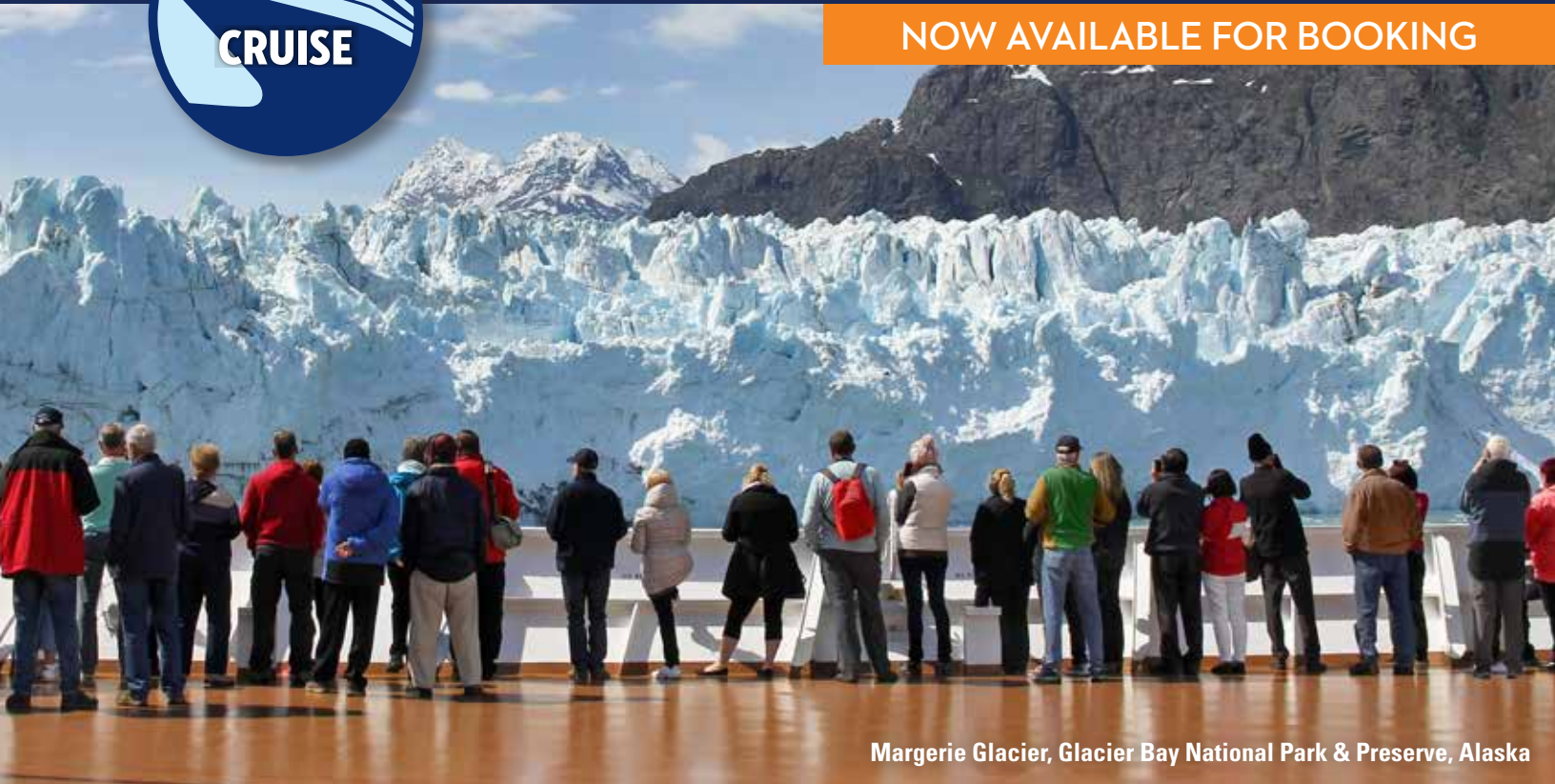
Margerie Glacier, Glacier Bay National Park & Preserve, Alaska