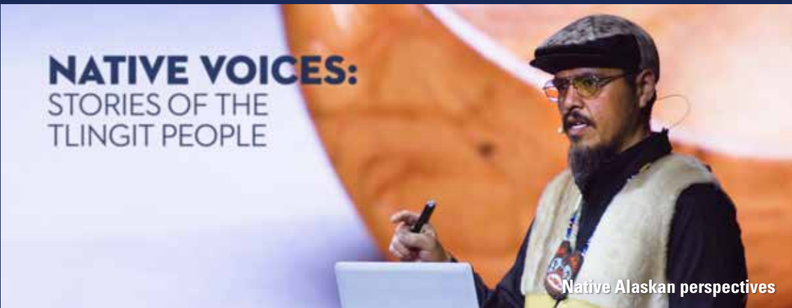
Native Alaskan perspectives

Click to LEARN MORE about ALASKA UP CLOSE®