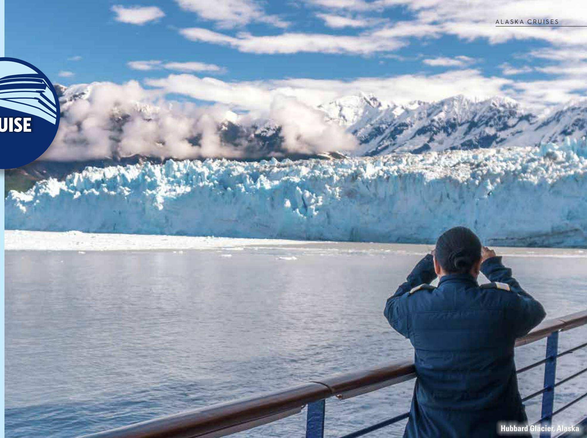
Hubbard Glacier, Alaska