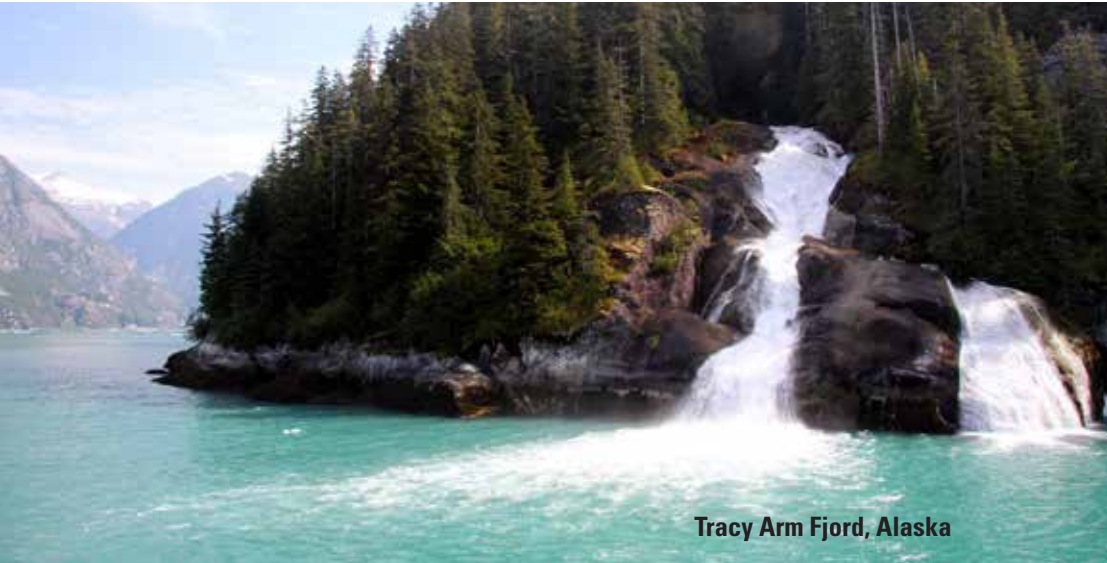
Tracy Arm Fjord, Alaska

♦ This sailing does not include a service call for shore excursions at Tracy Arm.