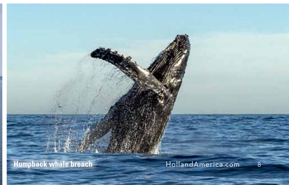
Humpback whale breach