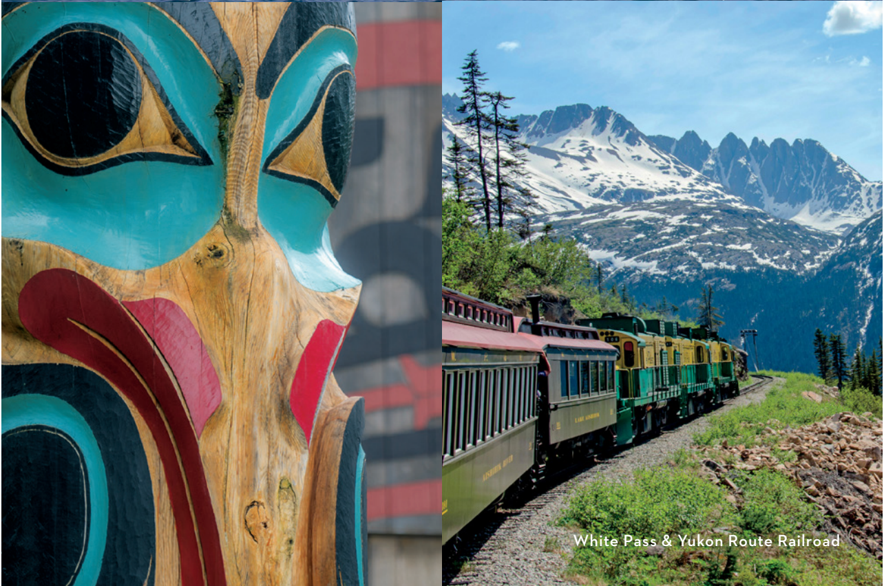
White Pass & Yukon Route Railroad