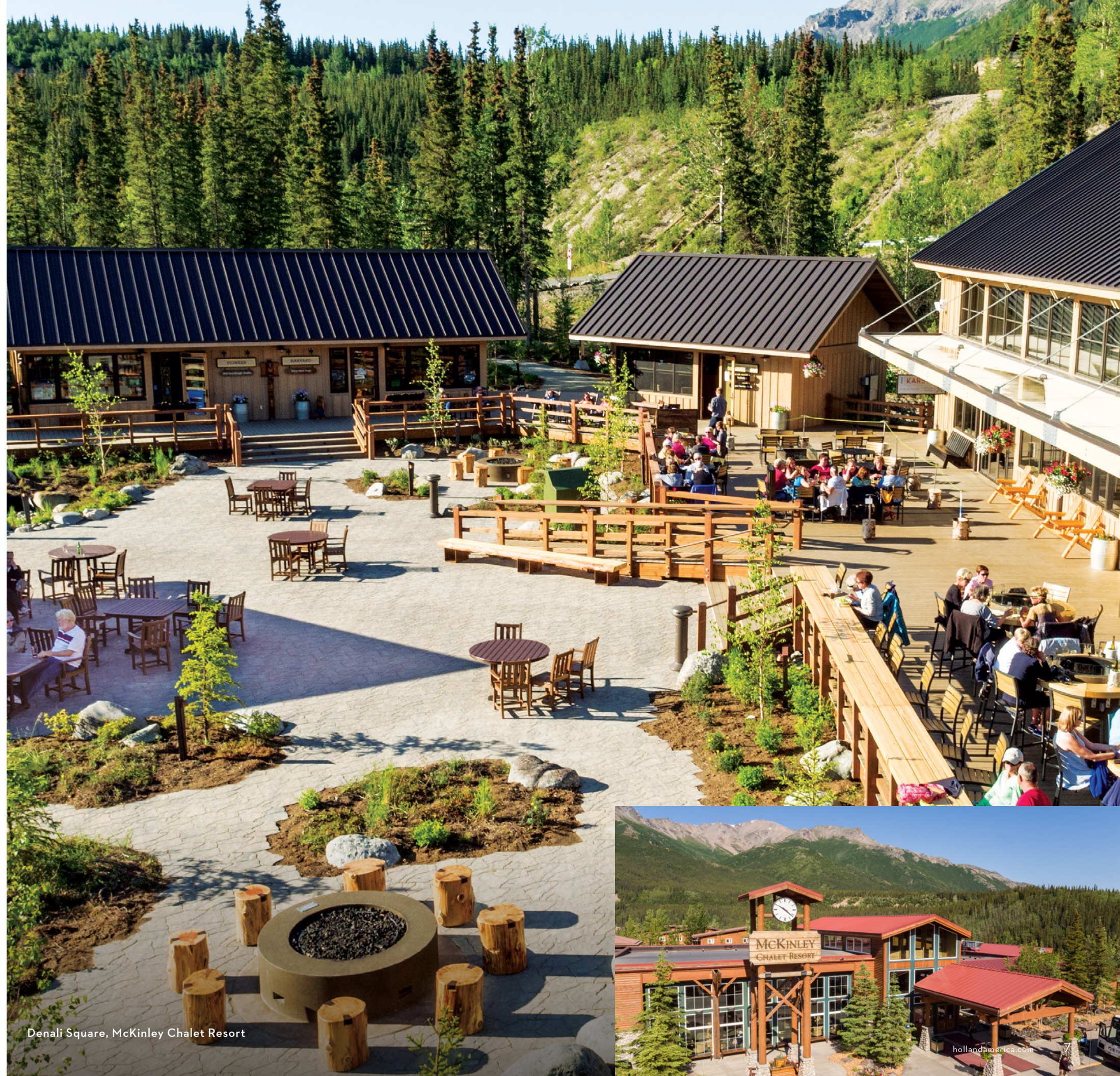
Denali Square, McKinley Chalet Resort

Extend your journey into the remote Yukon Territory with the only cruise line to take you there. A Yukon+Denali Land+Sea Journey combines the wonders of an Alaska cruise and Denali National Park & Preserve with a visit to the historic Yukon. Our long-time partnerships and insider access create an authentic experience, while knowledgeable Journey Hosts and exclusive hotels and resorts in Skagway, Dawson City, Anchorage, Fairbanks and at Denali make the journey easy, comfortable and convenient. Plus, you can sail aboard Koningsdam on our 2021 Yukon+Denali Journeys with Inside Passage cruises.