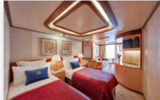
Princess Grill Suites