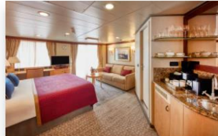
Queens Grill Suites